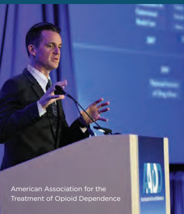
American Association for the Treatment of Opioid Dependence

Federal agencies call on NCCHC — long an advocate of MAT — to share insight and expertise on the subject. NCCHC specialists presented a plenary address and half-day seminar on expanding access to MAT in correctional settings at the American Association for the Treatment of Opioid Dependence conference, consulted with a Department of Health and Human Services Reentry/Criminal Justice Working Group, and sat on an MAT panel with other national authorities at the NSA conference.