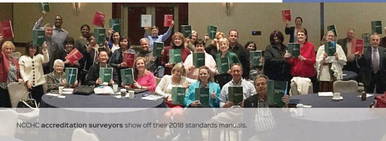
NCCHC accreditation surveyors show off their 2018 standards manuals.

The revised position statement highlights the complex developmental aspects of adolescence and the negative effects of housing juveniles in facilities designed for adults, including exacerbation of mental health disorders. It also describes the limited capacity of most adult facilities to adequately care for juveniles, including the lack of staff with appropriate education and training to work with youth and a heightened risk of physical and sexual assault.