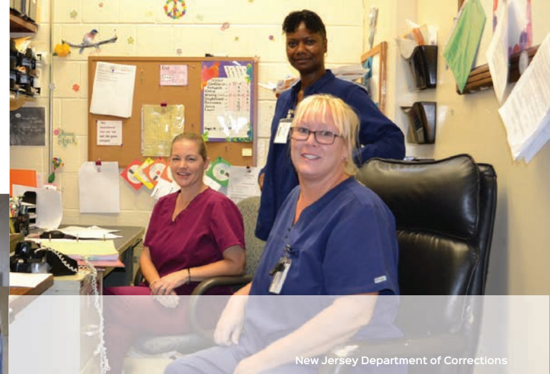
New Jersey Department of Corrections

Improving the quality of health care in jails, prisons and juvenile confinement facilities requires a concerted effort. NCCHC works with a large, dedicated team of health professionals, administrators and advocates who serve as subject matter experts, accreditation surveyors, consultants, conference speakers, webinar presenters, journal and magazine authors, certification test writers, exam proctors and other volunteers, with support from major national organizations representing the fields of health, mental health, law and corrections.