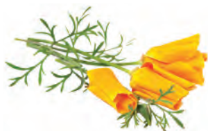
California Poppy - State Flower 'Eschscholzia californica'